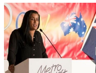
Young Women's Leadership