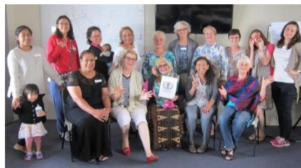
Leadership Training and Mentor Program

Supporting Women | Engaging Youth | Environment Sustainability