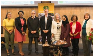
Peace Building forums, seminars, and conferences