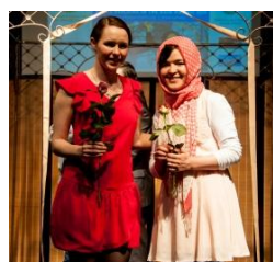
Bridge of Peace and Reconciliation