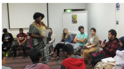
Character and Values Education Workshops