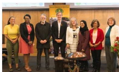
Peace Building, Way 2 Happiness forums, seminars, conferences