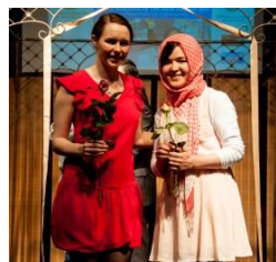
Bridge of Peace and Reconciliation