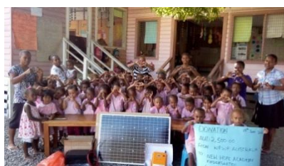
Pacific Island Nations Global Development & Aid Projects