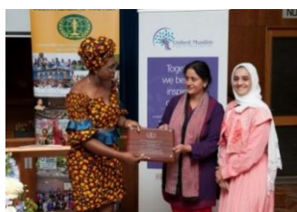
Global Women's Peace Network